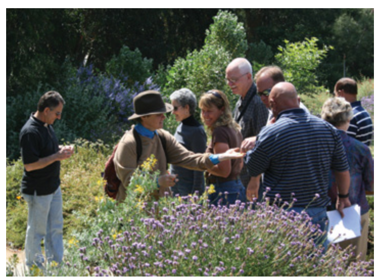
Tour of Beverly's Garden at the Maloof Foundation.

The Inland Empire Council serves as the local voice to state agencies and organizations: